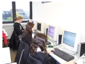
Common Portal-World of Learning